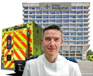
Hospitals and Ambulances