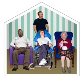
Care Homes and Day Centres